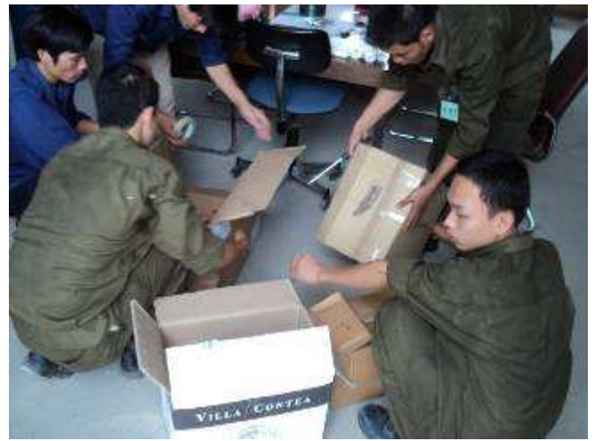
Foto21: It was 13:30h. 15:00 h they left and went off their bus.