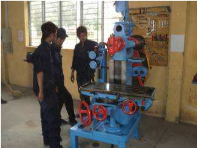
Photo 23: we bought this old milling machine in Ricardo. Because on the bottom sticks out a spindle, we had to make a stand, that the machine is approximately 250mm above ground. For us it is important that the trainees learn: even with older machines can live with that.