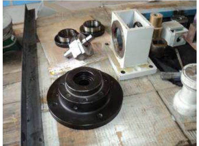
Photo 44: These are pieces of metal of our expansion plant WIAP LC05. The last few weeks, the apprentices turned scrap and we have told the head teacher Robinson, that it is no longer allowed. If we do something, we only make products that can be used. You can make 5 or 10 units LC5. Vices for other educational workshops. Even wheelchairs can make it, but no products that can not be used.