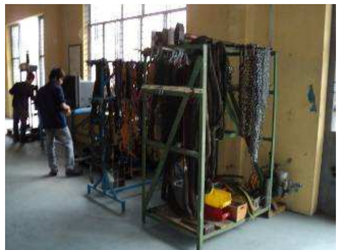
Photo 28: Now we can transport material with two racks, have much better order. It is important that the trainees learn to live with good order.