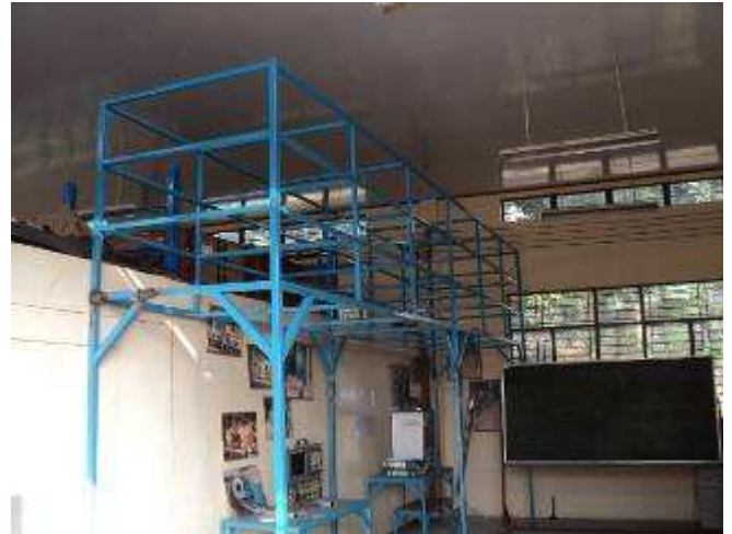
Photo 50: This should be the new document frame. Unfortunately we have to dismantle it after the holidays again. It must be made chances. We want that the drawings are sent to approve.