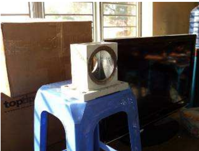
Photo 2: This case, for example, outline of 3 pages by hand, without a ruler.