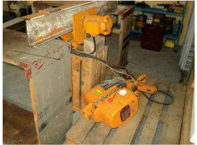
Photo 32: How the crane is hung up, it was a great mystery to the teachers and trainees.