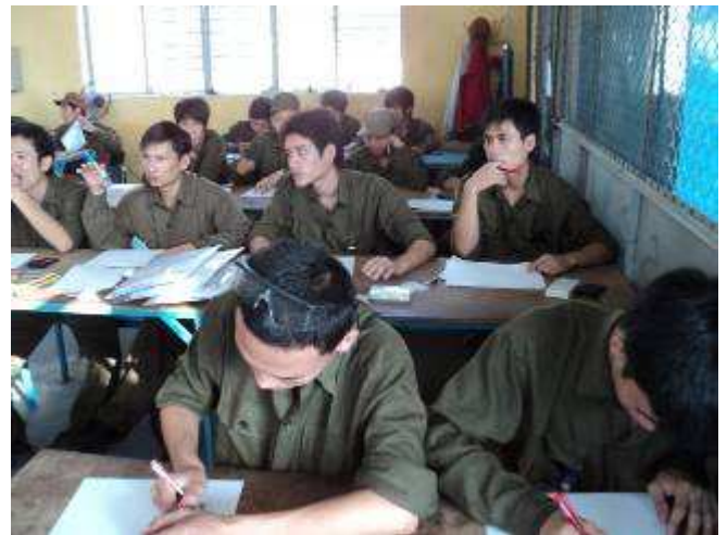
Photo 3: We think if we take seriously each apprentice, give them the confidence that they are very good.