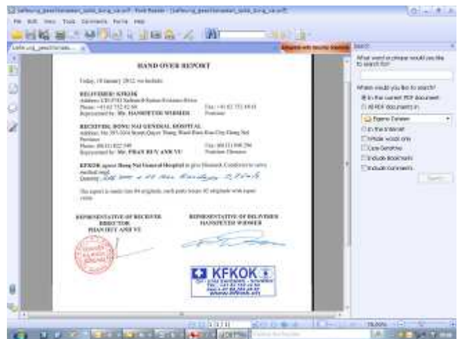
Print Screen 15: This is the delivery confirmation for 216 000 face masks