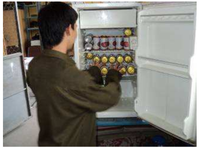
Photo 49: Today is 13/01/2012 and the 23/01/2012 is the big "TET" festival (New Year) in Vietnam. We have apprentices, which coming about 2000 km from here. That they can go home, we conclude that a week before the "TET", the school, so that all trainees have time to come home.