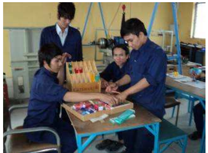
Photo 16: The Helpingman from Zofingen has besides many others, some office supplies given. This may very well be needed in the school. The apprentices have great pleasure in sorting.