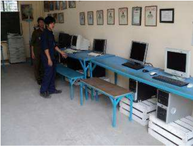
Photo 41: The construction is also getting better and better. The benches and tables, "Made in Vietnam" are (from us) and they did not even wobble.