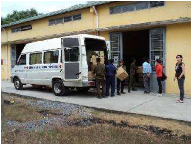
Photo 12: Here we load the face masks (6 m/3) paid by the company Biola, Switzerland and 13 case of bandages (0.6 m/3) from "Helpingman" Zofingen, Switzerland.