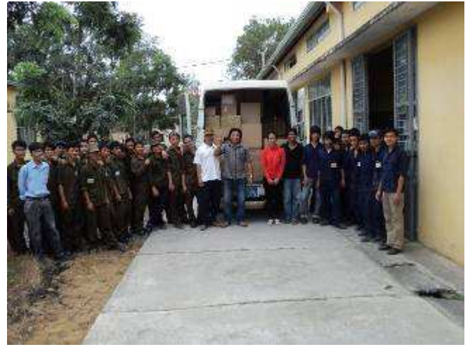
Photo 14: Almost all the apprentices we have gathered to make a photo. In the middle, the people from the hospital, Dong Nai.