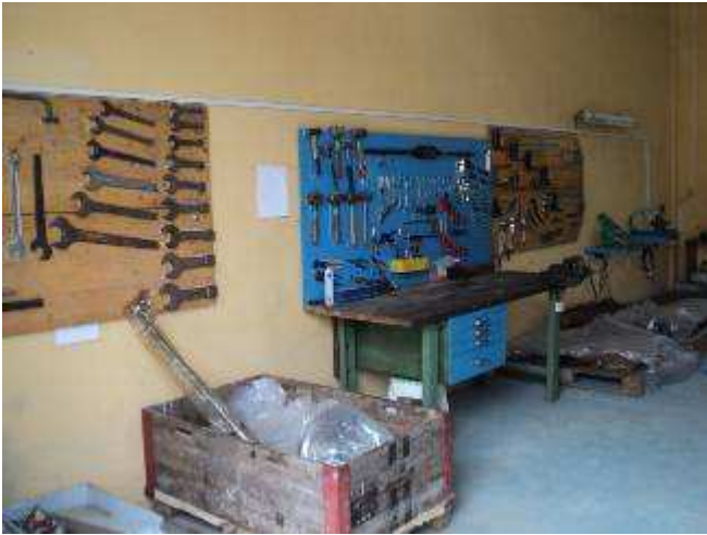
Photo 29: The big wrench to wrench size 90, we have in Vietnam in the school.