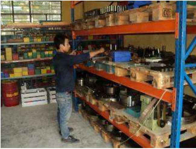
Photo 35: Even our camp in the assembly has been painted against rust.