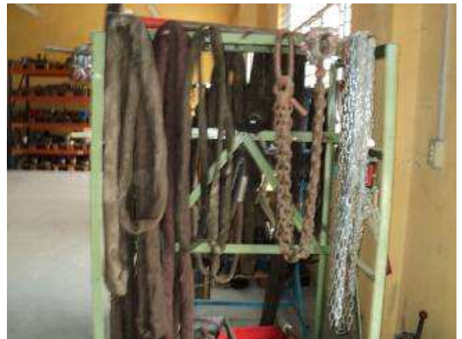
Photo 27: The whole transport material we brought from Switzerland.