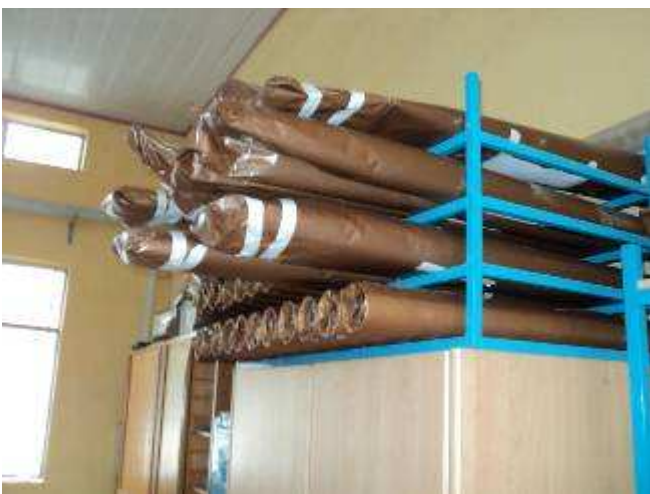
Photo 43: All of our drawings, many of our large lathes, vertical lathe, the gantry loader and the many conversions were wrapped with oil paper. Unfortunately, the roof is not very tight and sometimes it rained.