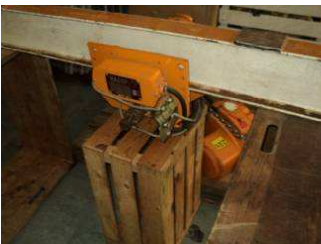
Photo 31: Here we add the 2 ton crane to be able to decrease by mass. We will make a useful, good drawing for the new crane.