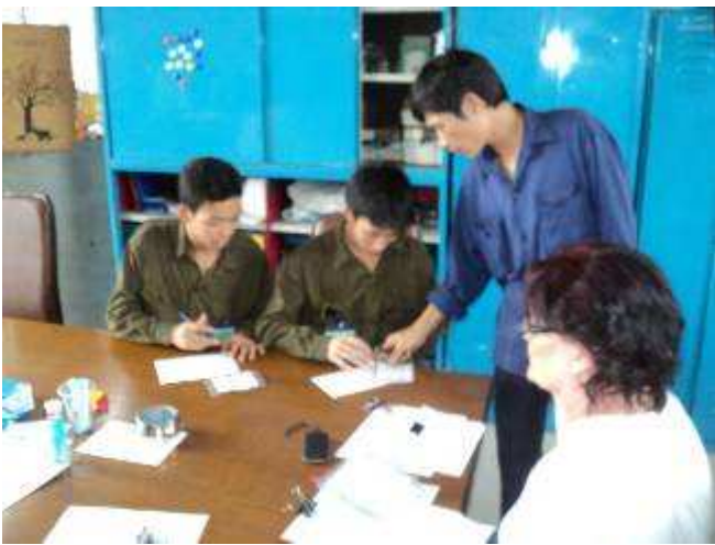
Photo 18: There are always three apprentices had to check the amount and then sign it.