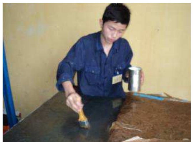
Photo 34: Everything what is blank, the apprentices had to now with an oil-rich former fat mixture and cover with oil paper.