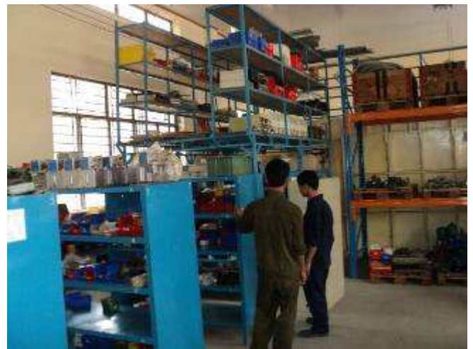
Photo 39: This frame is stripped, because it has a few small repairs needed. But then we make the same two frames. The good thing: make themselves, make mistakes, makes nothing, the only way for learning think ahead.