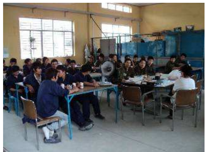
Photo 51: Here we drink beer before going home. Everyone will have fun and they say thank you to us.