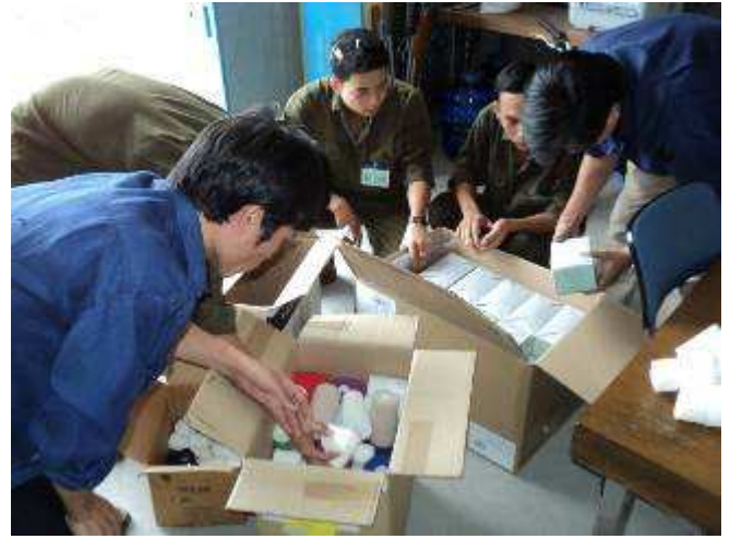
Photo 20: We asked them to bring some bandages and face masks in there's poor province. There's a medical station, where they live. We gave them 4 with boxed goods.