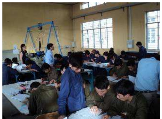
Photo 5: Severe School with regard to practice. This time, No. 1 draw freehand, elevation, floor plan and site plan.