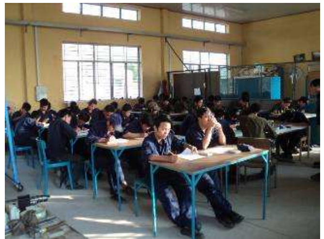
Photo 4: There are many trainees who work on homemade tables, then later the weight of her table to work out exactly to the gram. And they can do it? Our goal is that all the correspondence between theory and practice in their blood when they have finished the lesson.