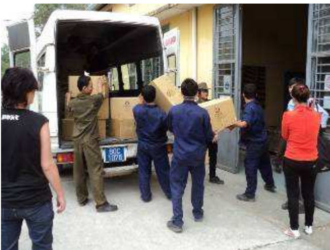
Photo 13: They had to load up on the roof that there was room on the bus.