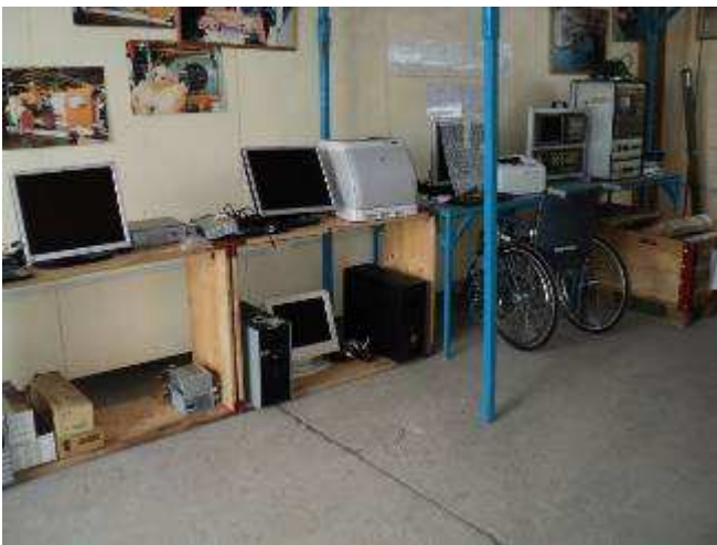
Photo 42: We got nice new computers from the Basel economic development agency. Very well, thank you. They are the nicest and greatest that we have now in school. The wheelchair in the rear, is included in our project.