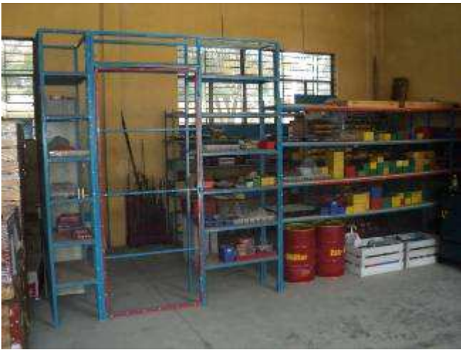
Photo 36: The bolts store and measurement tools was made lockable. We will try to give two apprentices responsibility for the camp. There is a computer with the warehouse management on Excel.