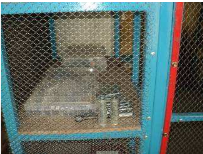
Photo 37: Now is finished externally with the goods to get out of.