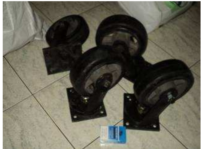
Photo 33: Here we have bought in the center of Saigon large sturdy wheels for our 2 ton crane. A piece cost 700 000 dong (30, - USD)