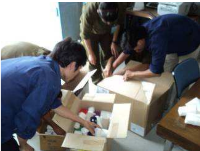
Photo 19: The 3 Camau apprentices we have paid for the bus ride, that they could go home on the "TET". One way cost: 220 000 dong, so we gave them each 700 000 Dong.