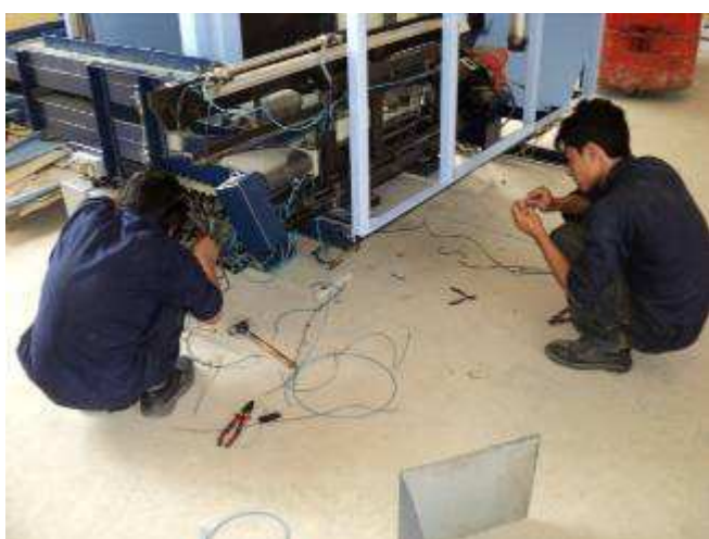
Photo 7: The apprentices in the time when we were not in Vietnam, not worked intensively on the two vertical lathes WIAP DM 2V on. But now it's starting again.