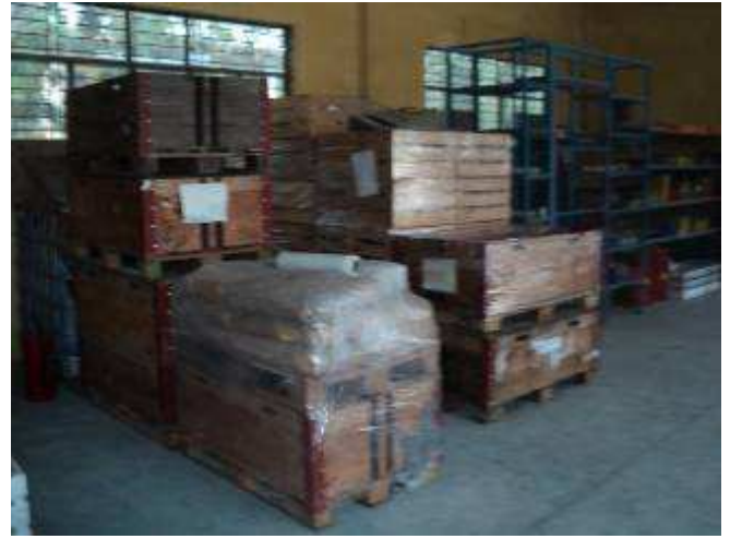
Photo 38: So now is only filler and a lot of folders in the room. Which can only be cleared when the frame in the area of the construction is finished.