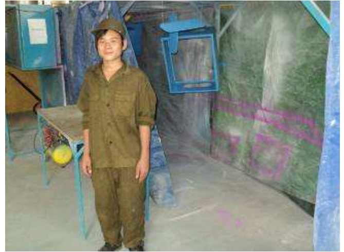
Photo 26: He might be our smallest apprentice in the B group. Rear panel where you can see it's for a training place with control CNC SINUMERIK 810.