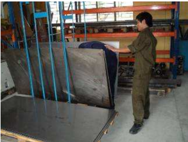
Photo 24: For nearly 3000 USD, we have brought steel and sheet metal from Switzerland. It is a bit tedious to drive around in Saigon to buy goods, we have bought in Switzerland.