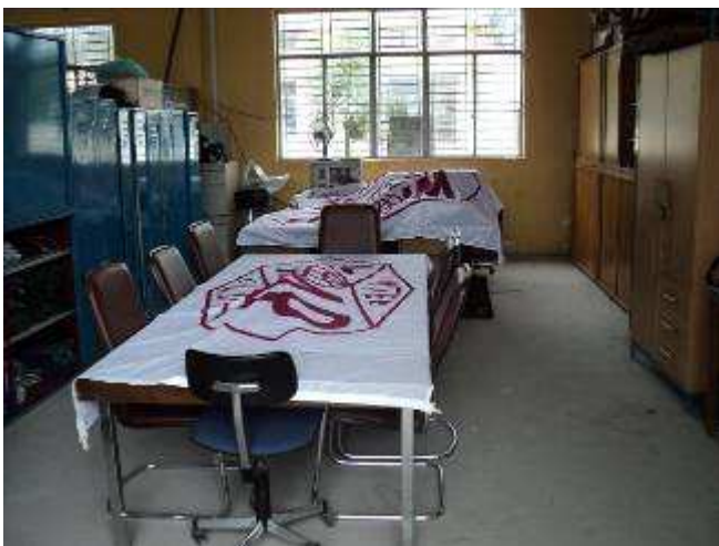
Photo 48: Before the "TET" we have covered our office place against the dust.