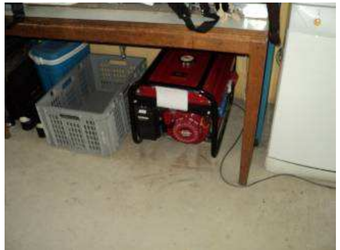
Photo 45: Here is a generator we were able to buy in Switzerland in Ricardo for a few hundred francs with 400 volts. 6,5 kW.