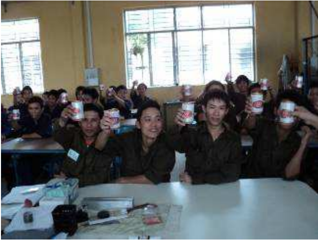
Photo 52.: Again raise the beer can and a Prost. Until next year for them now we hattten already a few days ago.