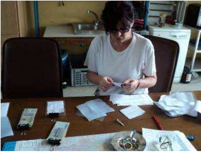
Photo 17: On the New Year we have the apprentices of group A given 1 million dong (50 CHF) and the apprentices from group B, every 20 000 dong (10 CHF)