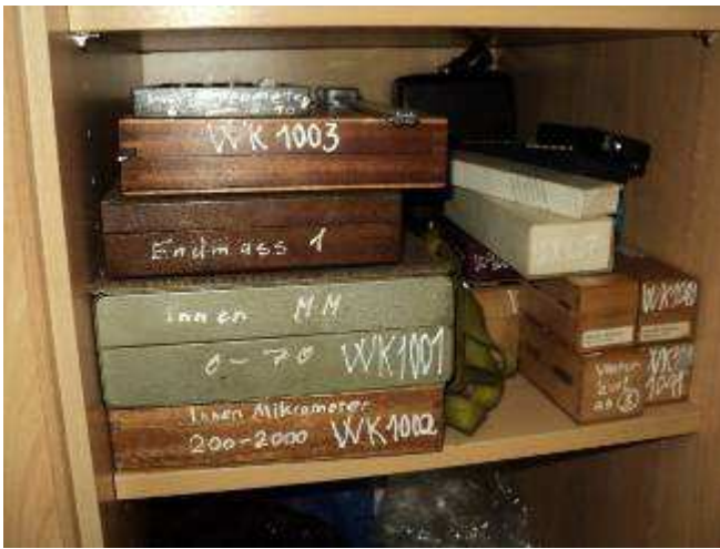
Photo 46: In our office closet are many measuring tools. There are many thousands of francs for measuring equipment in our school, with which you can only teach and work, if you have them.