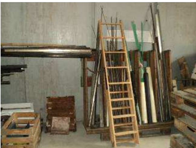
Photo 25: Even the round material stand we took from Switzerland. Plastic and 6 square much material