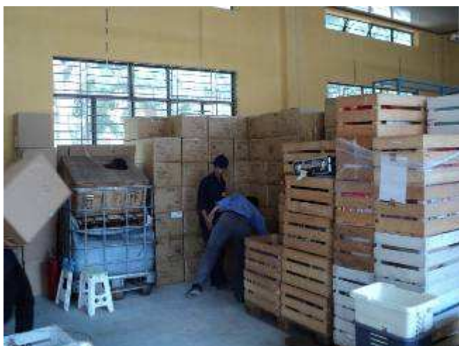
Photo 6: Here we have opened the room 5, where all the goods which were in the container No. 8 was stored. Now we unpack. At the back of the cardboard boxes the more than 200 000 face masks.