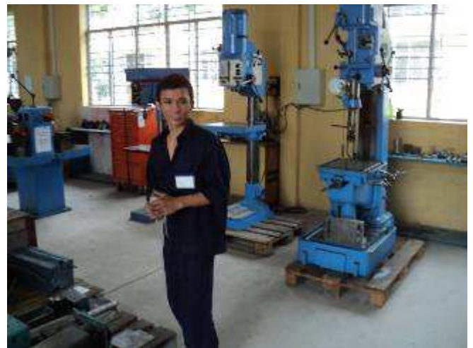
Photo 22: Our 3 drilling machines. The median is the new that we brought from Switzerland. Specifically for cut thread. These we bought in Ricardo CHF / USD 800, -. The trainees have good refurbished. Machine type Coradi Spain