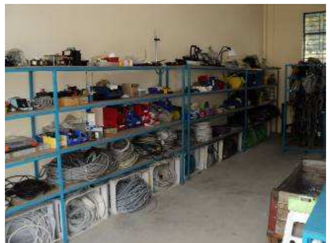
Photo 40: The two long racks in the electrical room are ready too.