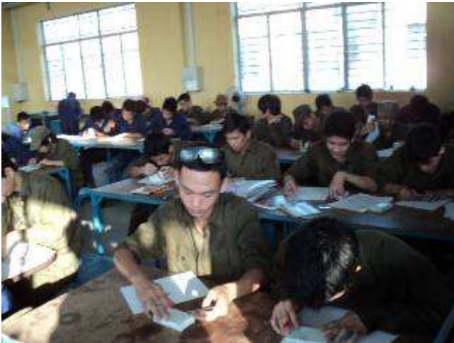
Photo 1: Our 21 A and 25 B apprentices (46 total) must make this time a large amount of tests.

"Education for every one" Secondary school of southeast area mechanics and electricity at Thien Tan commune. Created: 01/13/2012 Saigon, Iris and HP Widmer