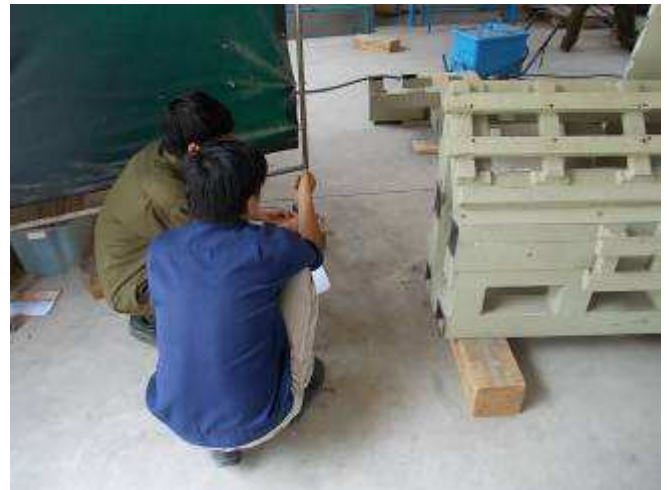
Photo 32: Here is an apprentice at the smallest machine. The DM2 B, which is a mini slant-bed machine, making a sketch, how to fasten the screw spindle.