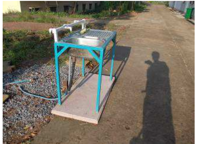
Photo 3: Now no longer have the apprentices wash their hands on the floor. 4 water taps are available to them.