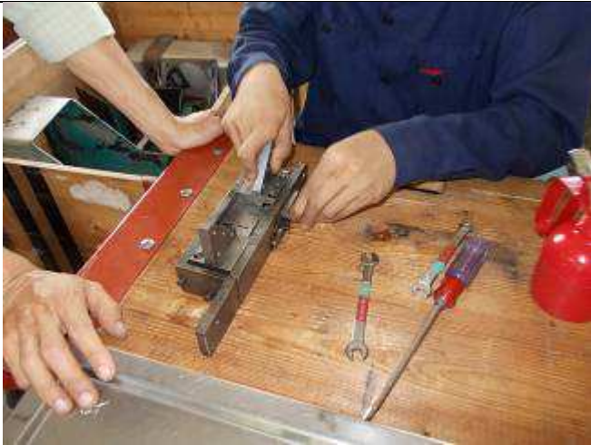
Photo 23: The grippers of the WIAP DM2V No. 10 023, has sporadically jammed. Now it is broken.