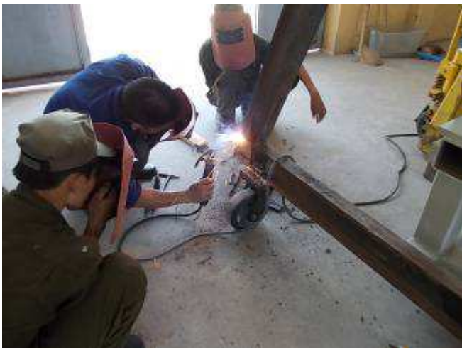
Photo 30: Here is further reinforced by welding, also a supporter of teacher.