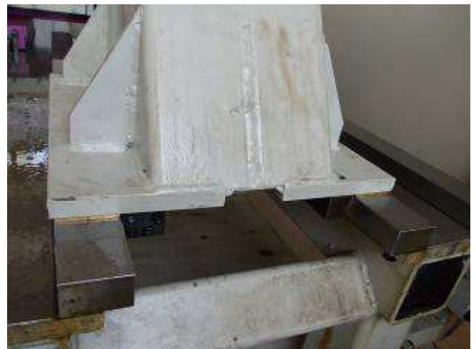
Photo 16: The tailstock robust, heavy. With side guides mounted 8 x M16. Now scrap then.