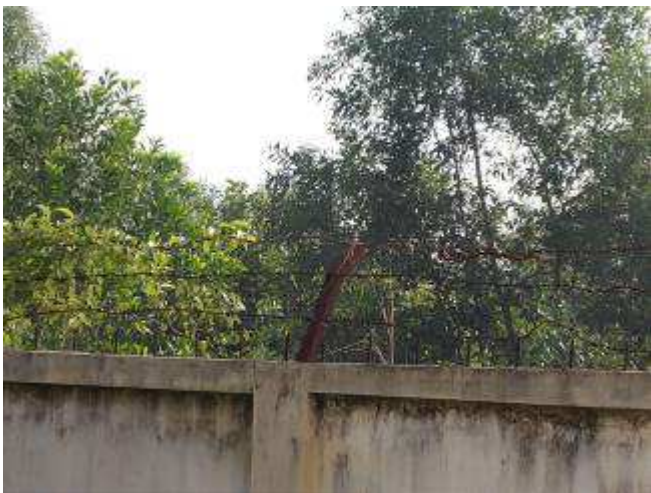
Photo 6: The view from the window also shows the nature. At the bar sits a lizard.