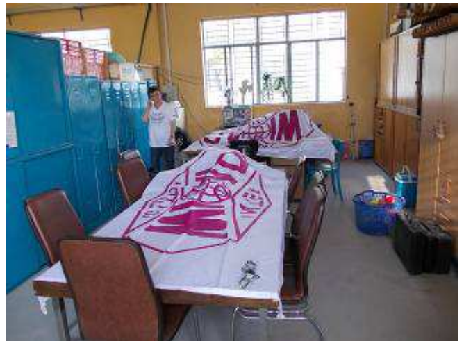
Photo 4: So it looks like when we come on Monday morning. The office is covered because it is very dusty. We have no air conditioning. Often it is almost 40 degrees in the office.