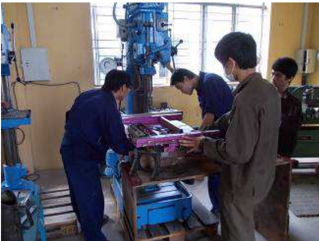
Photo 12: This is the cross-slide of DM2S drilled. The next time we have a regulation table, so that everything can be put into the water.