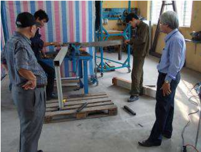
Photo 11: This is the gallows for the DM2S machine. All positions of the machine should be able to be easily operated. The high we are reducing by 200 mm compared to Europe.