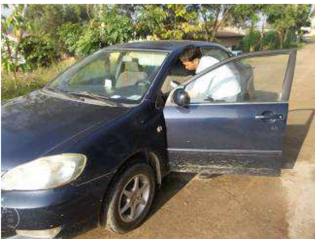
Photo 2: With this car and driver, we drive 50 minutes every day 2 about 38 km, round trip. Our property is located approximately between Saigon and the Center School.