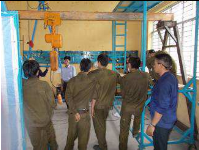
Photo 29: Now they have brought us to show: Yes, the crane runs. And he runs.