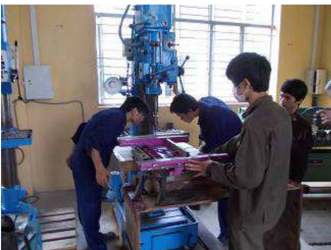
Photo 13: Conscientiously work boys. The eye issue is still not good.