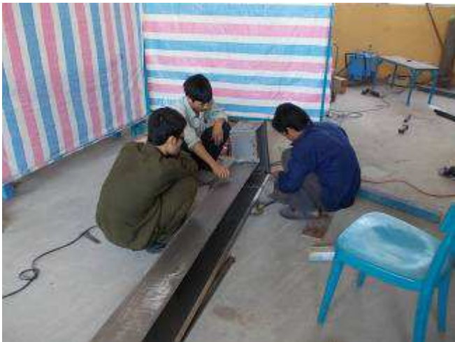
Photo 18: The cooling water tank is to DM2S machine. All designed for the 2-meter-plate machine.