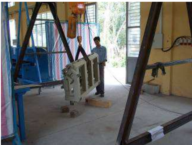
Photo 30: Test weight. Existed, but it rocks a bit when he slows down the side. We strengthen a little.