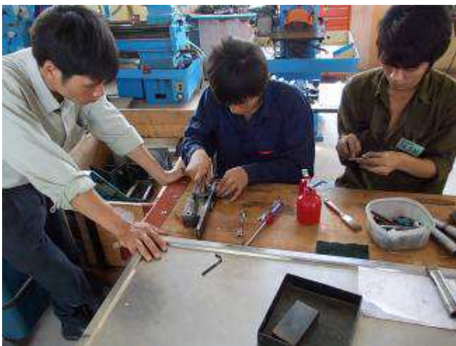
Photo 24: The A18 apprentice. He has worked the last time only electric and has learned a lot. We will dig him as a supporter electricians next trip. Since we have no teachers with electric field of study.