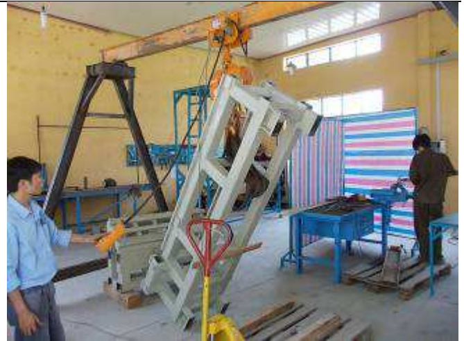
Photo 31: Now, we raise the bed of the S DM2. We must have a solution for filling. The filler concept, we have changed something with the filler. There are 2 pieces 800 mm crane increases.