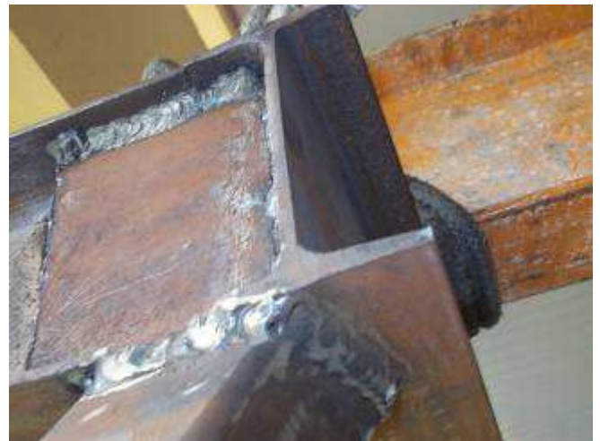
Photo 27: There are apprentices, and if you can not practice, you do not learn it. But it is good.