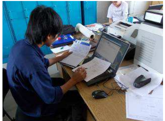
Photo 9: This apprenticeship will count all expenses since we are here together. It is important to us that the boys also get the paperwork knowledge.