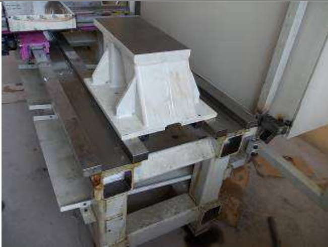
Photo 17: Yes, in Vietnam is all a bit dusty and dirty. We have to keep clean. Even the rust has to be considered good.