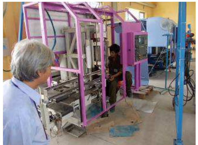
Photo 22: The DM2V No. 10 022, needed more time to prepare for them. But that's good. With so many apprentices have, to have jobs, so they can learn something. This machine has been almost completely dismantled in order to fit it.