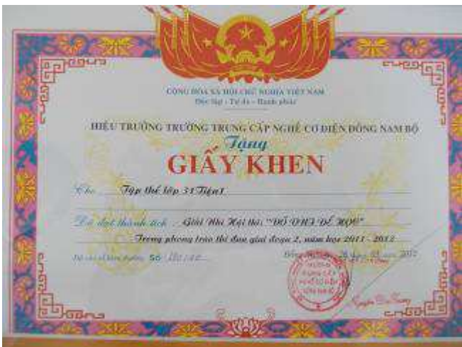
Photo 7: Compliments to our B group. They have received an award in a competition. They are very proud and so we to.