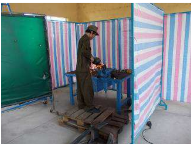
19th photo 2 pallet the apprentice need for to work in the vice.