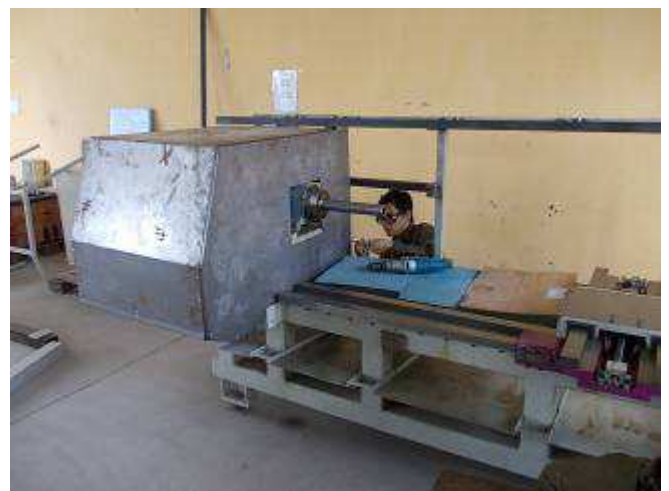
Photo 10: That the machine building has a lot to do with sheet metal work is a fact. That is why our apprentices must also make all the plates themselves.