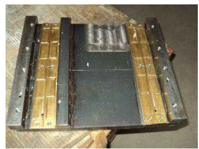
Photo 04: This slide has a lot of lubrication holes. We have now also decided a change so that more can be scraped. That's all good, the drawings will be changed immediately.