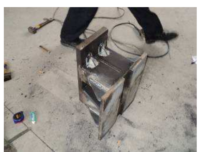
Photo 15: Now Robinson has the tailstock bracket welded ready yet, so he makes a lot. We must be careful that the teachers do not always catch only the most beautiful work. The teacher then left the apprentices not so nice work.