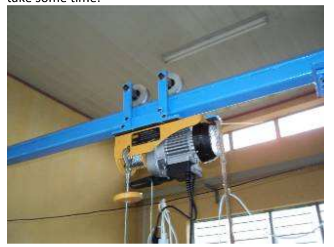
Photo 02: Our Crane number 02 has now helped us a lot, so we are much faster forward. After the holidays, we make two heavier versions.