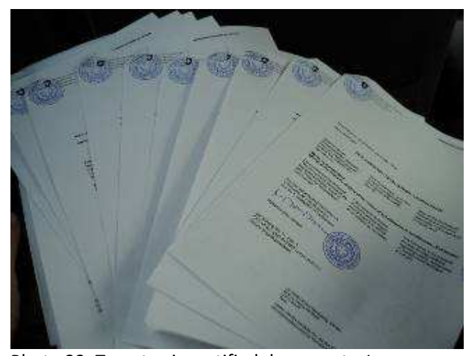
Photo 22: Twenty-six certified documents. In Switzerland, we have per stamp, 20 - paid CHF; totally 520th - CHF. Then another 200 CHF for Hanoi and for the certified copies of CHF 150 - Such papers are not so cheap.