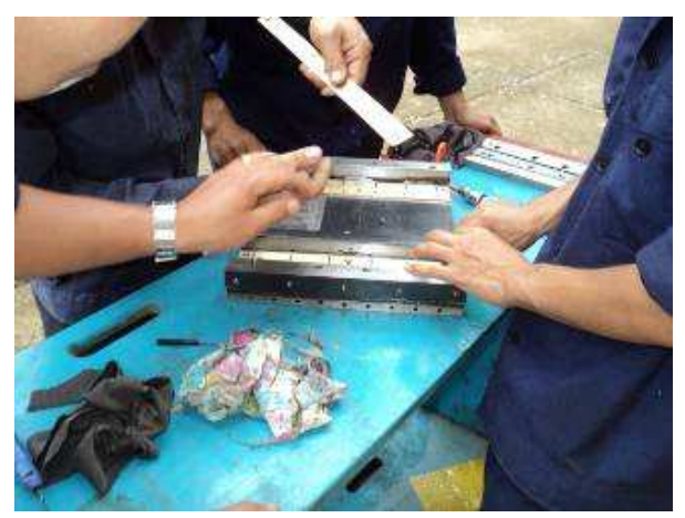
Photo 10: Since we have three compressors, compressed air is wonderful for the apprentices. But they have out in the open air, blow everything good and clean to prevent dirt particles get under the sliding surfaces. Slowly they realize that we are very attentive and have no tolerance.