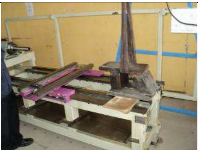
Photo 14: Yes, that looks quite stable and has pretty weight. An apprentice must immediately behind the drawings, and examine how the part is and what is the drawing. Lubrication and tailstock clamping apprentices now have to construct yourself ready and then draw.