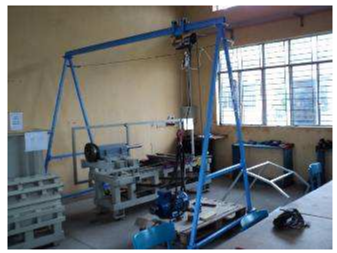
Photo 01: Some people think it looks more and more all from the same. There are many hours behind such a small machine. The training is important, so it will take some time.

Project WIAP-KFKOK Vietnam, "Education for every one" 15 .07.2011 Secondary school area southeast of mechanics and electricity at Thien Tan Commune, Vinh Cuu District, Dong Nai Province, Vietnam created: 15.07.2011