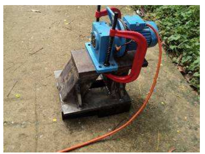
Photo 17: We do it outside because the hall floor is not good enough. The hall floor is vibrating excessively. 30 minutes at 4300 rpm is relaxed.