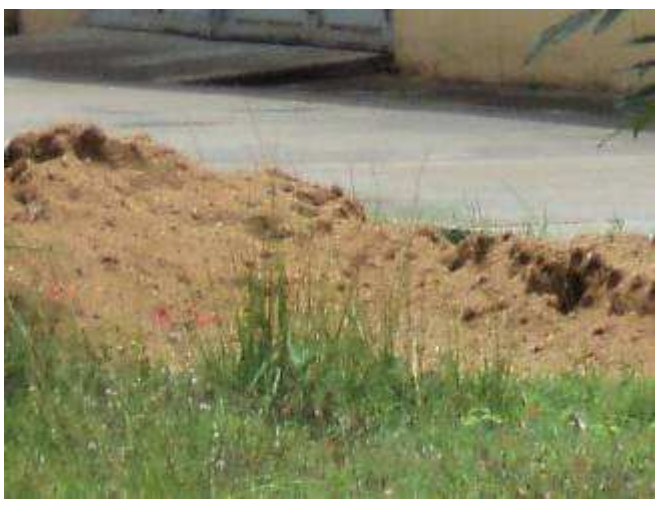
Photo 19: Outside there is a heap of sand and our apprentices are always so dirty fingers. Our sand soap from Switzerland, is assumed.