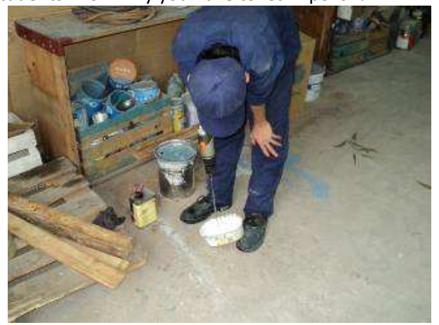
Photo 06: Now prepare the apprentices color to the machine base of the second School machine to paint.