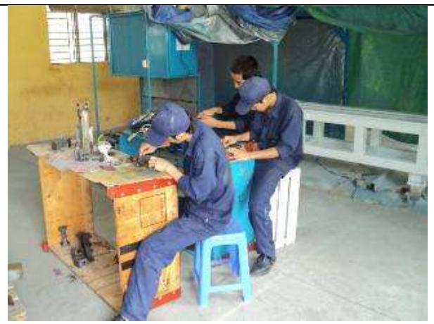
Photo 08: With great patience, they can sand the rust with sandpaper on the work pieces, which we prepare for painting.