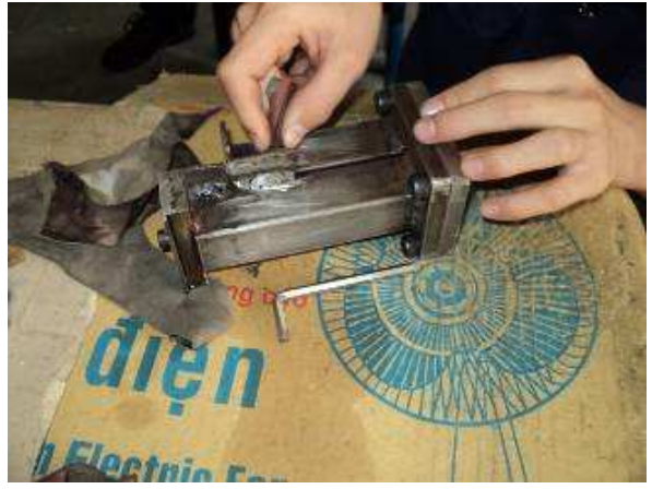
Photo 09: How nice it would be to use the sand blasting cabinet. But we will wait a bit so they get even the instinct to steel.