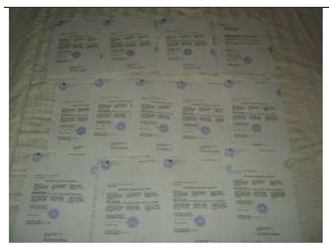
Photo 21: Finally, yesterday came the text message from the Consul General Beat Wafler, our papers have arrived from Hanoi.