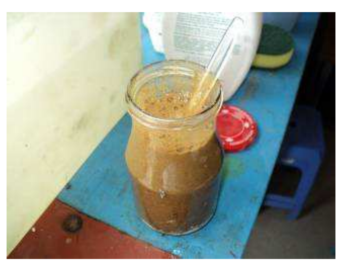
Photo 20: OK, we make the soap ourself. Sand and washing-up liquid, which can be purchased in 5-liter jugs for about 3 CHF, and this is the finished soap.