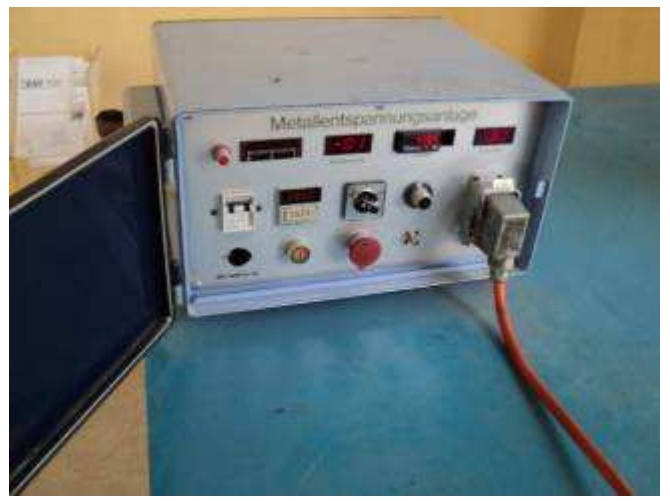
Photo 18: This is an old LC 20 WIAP metal expansion plant, which we bought back from a Swiss client, as he changed the production. What would we do without vibrate!