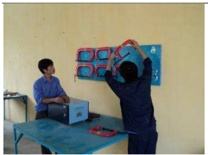
Photo 16: Before the tailstock console is being processed, it must first be relaxed even with vibration.