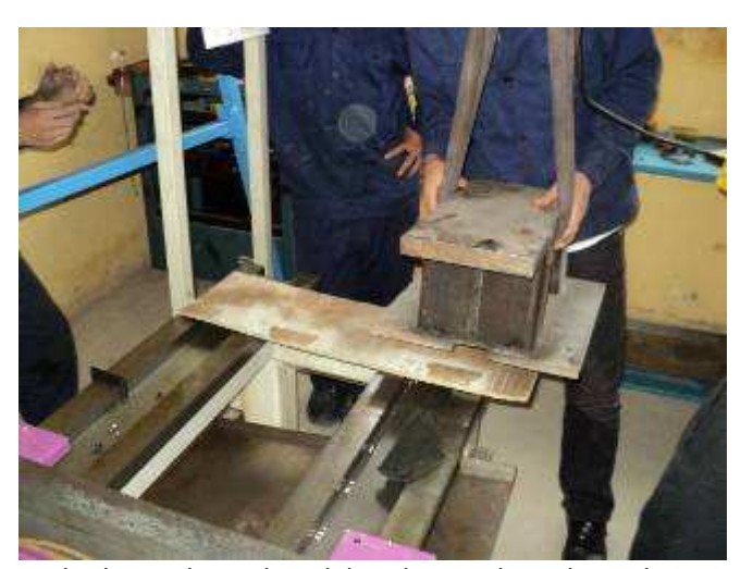
13th Photo This tailstock bracket we have brought from Switzerland. Now we make them ready. Robinson, the head teacher has so much fun to work there.