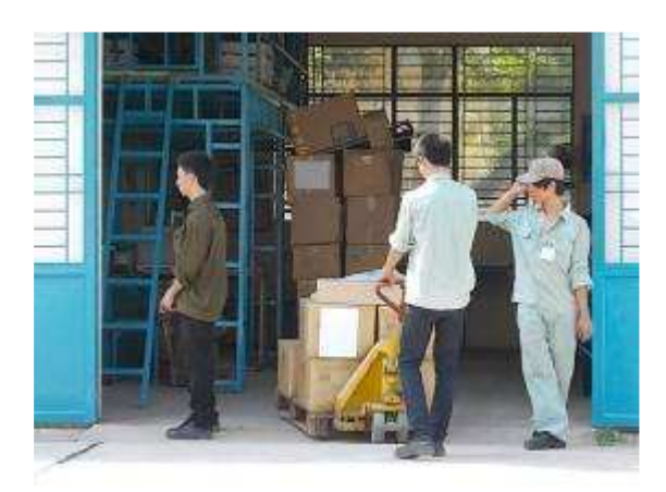
Photo 10: Tip Top how our apprentices done the work. Thank you. Even for them, the day was a special day. Sure our apprentices are now in the neighboring hospitals for emergencies, not so bad repealed.