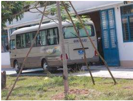
Photo 9: By bus, the hospital No. 19 (30) pick up the skin laser machine, was given by KFKOK. The door of the car was too small. It had another vehicle coming.