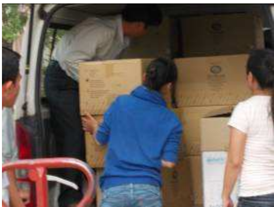
Photo 7: It was a 40 feet container, almost 80 m / 3 of relief supplies, over 650,000 face masks. Around 27 vehicles arrived this Tuesday, 14/05/13 at our school.