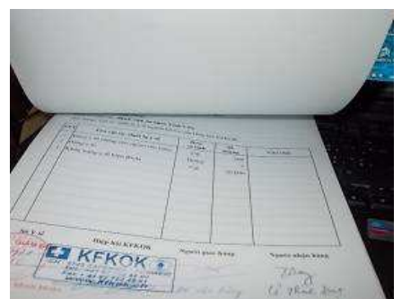
Photo 11: 30 These papers were donated for each hospital, which was then signed by the recipient by the Health Ministry on the left, beside of our association KFKOK, right.