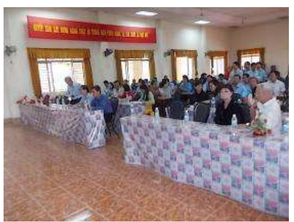
Photo 16: Now we are in the board room (auditorium). All teachers and our apprentices are also here.