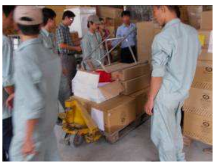
Photo 8: C. Our Apprentices (1st year), a man and a woman from the Health Ministry Dong Nai province. Neighboring province of Saigon have everything well organized.