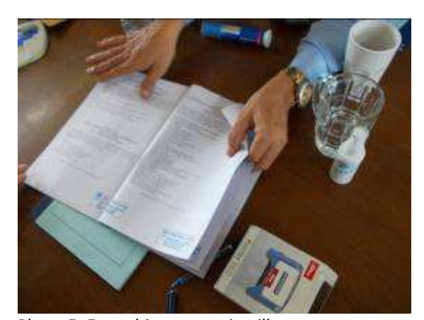
Photo 5: Everything stamp, it still goes to legalization. Then it's urgent to Hanoi