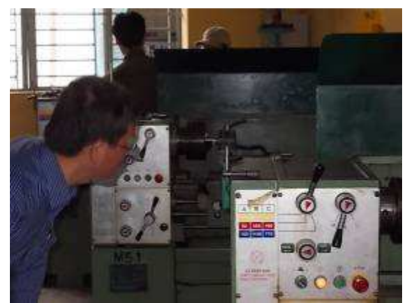
Photo 15: As I show the governor where our lathes come. Now these are the only machines, which have borrowed from the school, and they come from Taiwan. Therefore, they are not painted blue. This we must change soon, because all of our machines are from Europe, the majority from Switzerland.