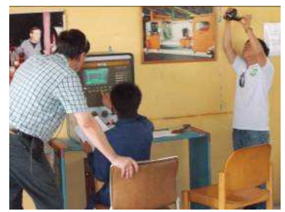
Photo1: the last 2 weeks were often the media in our school. This makes a state youth magazine a movie.

Project Wiap KFKOK Vietnam Project start November 2010. Our present Labour Start: 15 April 2013 to May 15, 2013. Final report of the trip.