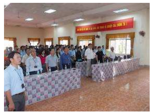
Photo 17: Everyone stood up. There was singing the Vietnamese national anthem, even to the worship of the late Ho Chi Minh, who is in the room on a statue