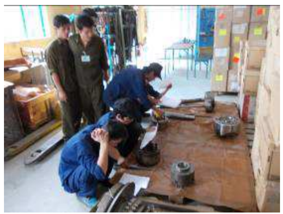
Photo 18: On the items are to write down the apprentices who have the spindle nose size because lying spindles, ASA 5? ASA 15? Long they studied the drawings.