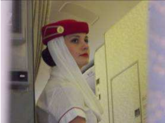
Photo 2: The first time we flew with Emirates flight company. There were nice flight attendants. The 6 hour flight Zurich - Dubai, then 6.5 hours Dubai -Ho Chi Minh City were divided easily.