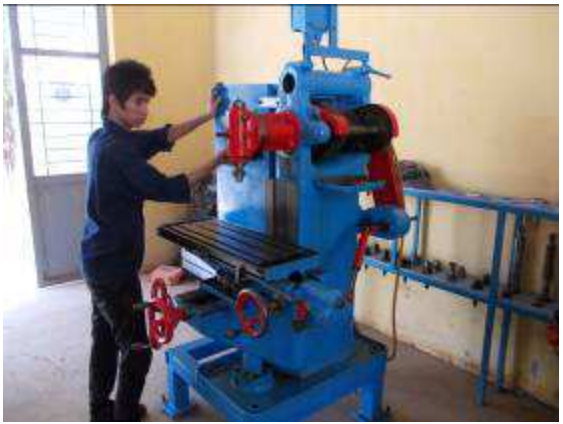
Photo 22: The maintenance system has 3 different work orders. First Visual Control 2, Inspection, and 3 Geometry control. The "Visual Control" is all months. Inspection 2x per year. Geometry 1 x per year.