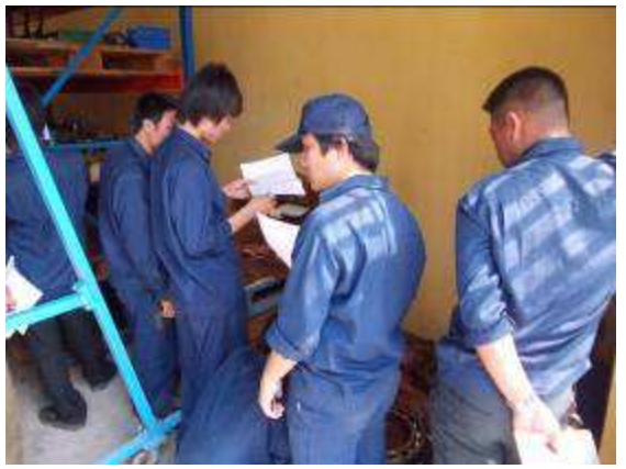
Photo 16: The apprentices must provide ball bearing numbers and measure. Long they studied the papers. The B apprentices were employed as head of post.