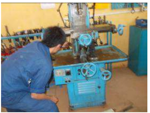
Photo 23: Now for the first time made an inspection and a visual inspection. Then right in the paper, which then add one year to be deposited in the yellow box. So we can also people who are not of the commission from school, and to go to school and make an inspection if the maintenance work is also done according to plan.