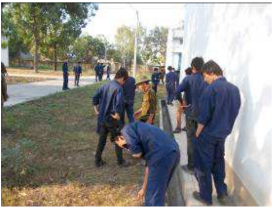
Photo 31st Here the right apprentice is A18. He smokes too much. He has read the hands in the pocket, while the other cigarettes together, which could be by him.