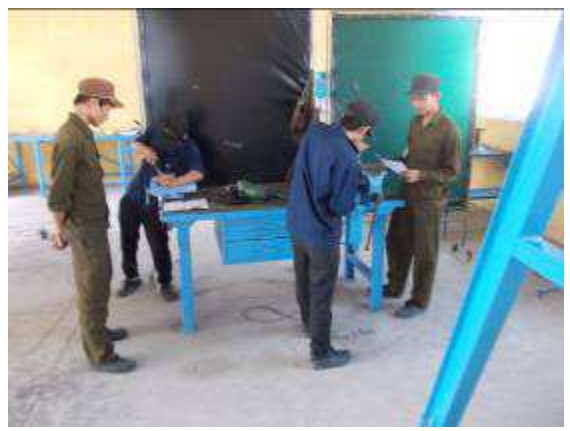
Photo 15: The Plate is a 0.5 mm phase are made. For all work, there is a start and end time. Is dotted with negative points. The test is 100 points less negative. This is the first practical test, we made so far in school.