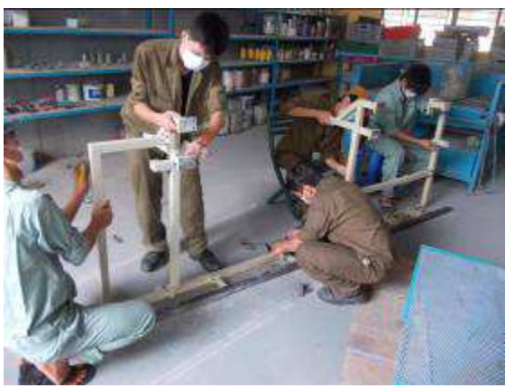
Photo 7: At the small CNC lathe WIAP DM2S saw the frame very dirty. We said, new paint, dismantle everything. This is being done now, but soon 2 weeks is the context in painting. Why?