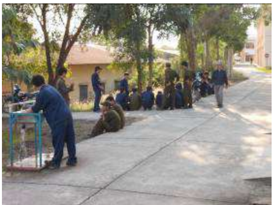
Photo 28: While dressing the part of the apprentices, all other sit outside, even 1 hour before closing time, and wait for better times. The apprentice chef sitting on the moped and looks to the wait! What a role model for apprentices!