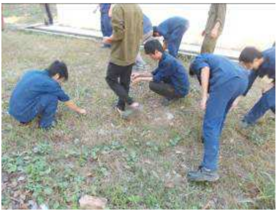
Photo 30: Today there is pocket money for the apprentices. You know it. So we said, now before we run to the distribution warehouses 1,2,3,4,5,6, and gathered all the cigarette butts. None stooped to myself I pick up 3 stub. Then they realized what it is about and finding stumps went.