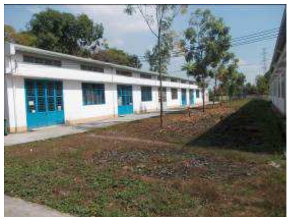
Photo 5: The Halls 4 to 6, since part was painted, but 2 doors. Why not?

The answers were very illogical. 3 months over 50 apprentices and only 4 doors paint? That must change, so the apprentices learn just how it is in a holiday camp.