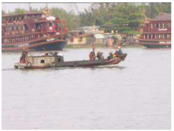
Photo 3: Back in Vietnam. On river in Saigon where we go from time to time on Sunday drink coffee and watch the everyday life on the water.