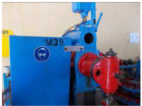
Photo 21: Each machine has a number. Each machine has the yellow box with the number. The original documents may not be removed from the yellow boxes.