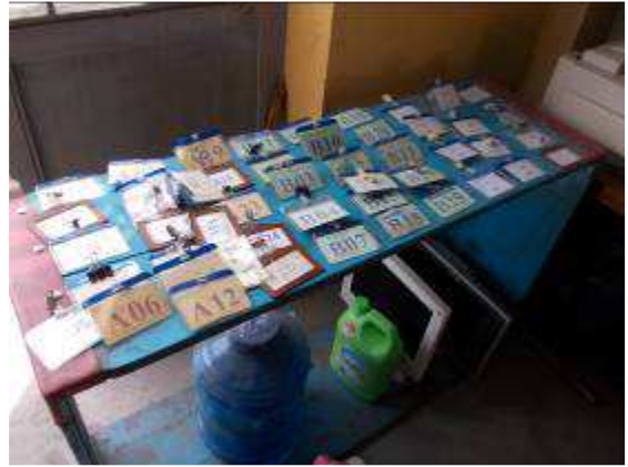
Photo 8: Our numbers which our apprentices wear whenever they are present. They were at the beginning, without having to be picked up, easy on the pallet frame. Here, too, will be seen that the teachers do not recognize that the system simplifies the presence control. There are trainees who come in the morning, log in, then they disappear. Working with the number before the pick, then leave before eating again, we know better who is there and who is not. But the teacher did not want to know any.