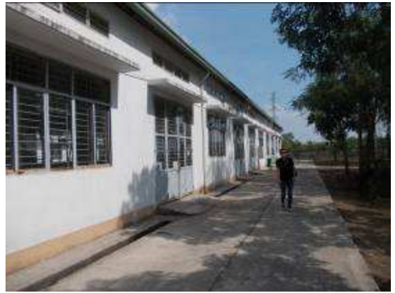
Photo 4: Back 02/01/2013 at school a bit pensive, because we see that lacks discipline. The most important point in the school when the apprentices will be something. And for the teachers responsible. The Hall 3 has still not been painted new doors.