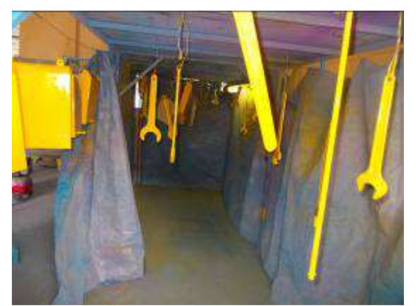
Photo 6: In the Hall 4a were in the frame primed wrench. Why not make it finally be painted? OK, then it went quickly.

The answers were very illogical. 3 months over 50 apprentices and only 4 doors paint? That must change, so the apprentices learn just how it is in a holiday camp.