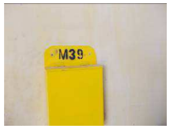
Photo 20: Since more than one year we've always wanted to introduce the yellow box system. Provided at each machine a box containing the maintenance schedules.